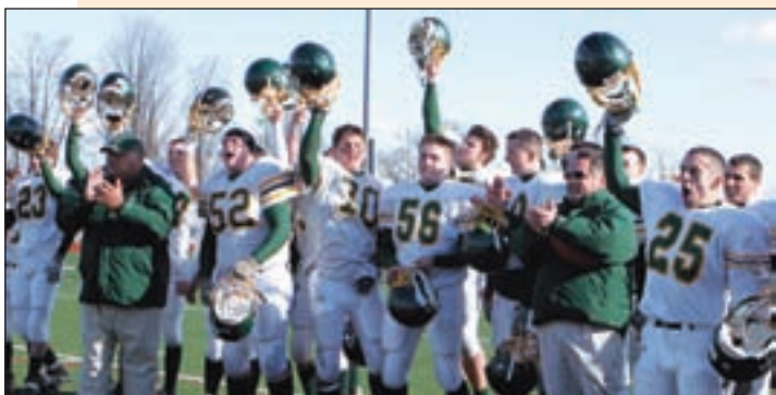
The Oakmont football team celebrates after capturing the title of champions at Central/Western Mass. Superbowl on Dec. 2 with a 28-0 win against Frontier Regional High School.

Ashby Free Public Library also marked another milestone this year as it reopened after the expansion was completed. The grand opening of the much larger library was opened on Oct. 22 with a ceremony on the Town Common and a reception in the completed building.